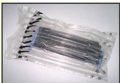
COMPATIBLE HP 2600 AIRBAG (OEM-STYLE)